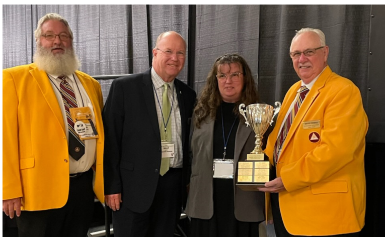
2022 Sony Cup Champs